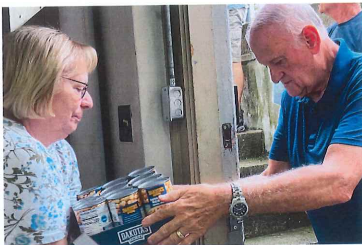
A case of canned food is carried in by volunteers of Mother Teresa Food Pantry which operates from St. Ann Church in Bristol.