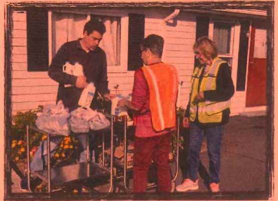
People who are suffering from food insecurity can pick up essentials on the campus of Blessed Sacrament Church in Hamden, part of St. Paul VI Parish, on the second and fourth Saturdays of the month from 9:30 to 10:30 a.m.